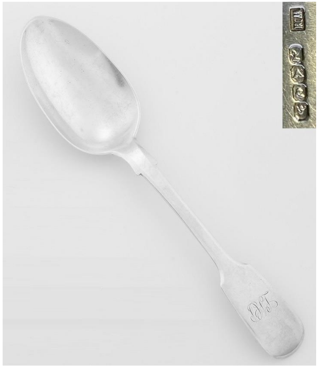
Old English pattern