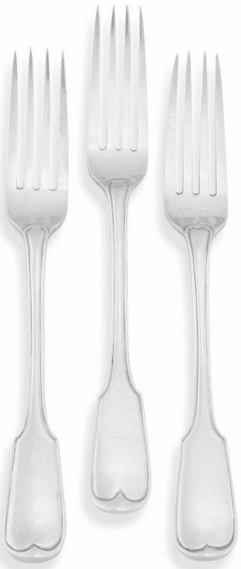
Fiddle and Thread Pattern