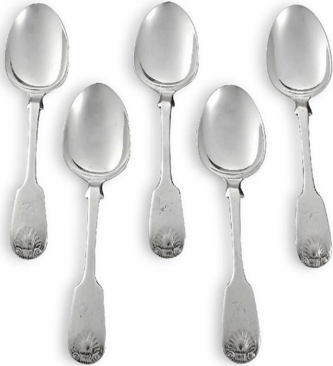
Fiddle and Shell Pattern