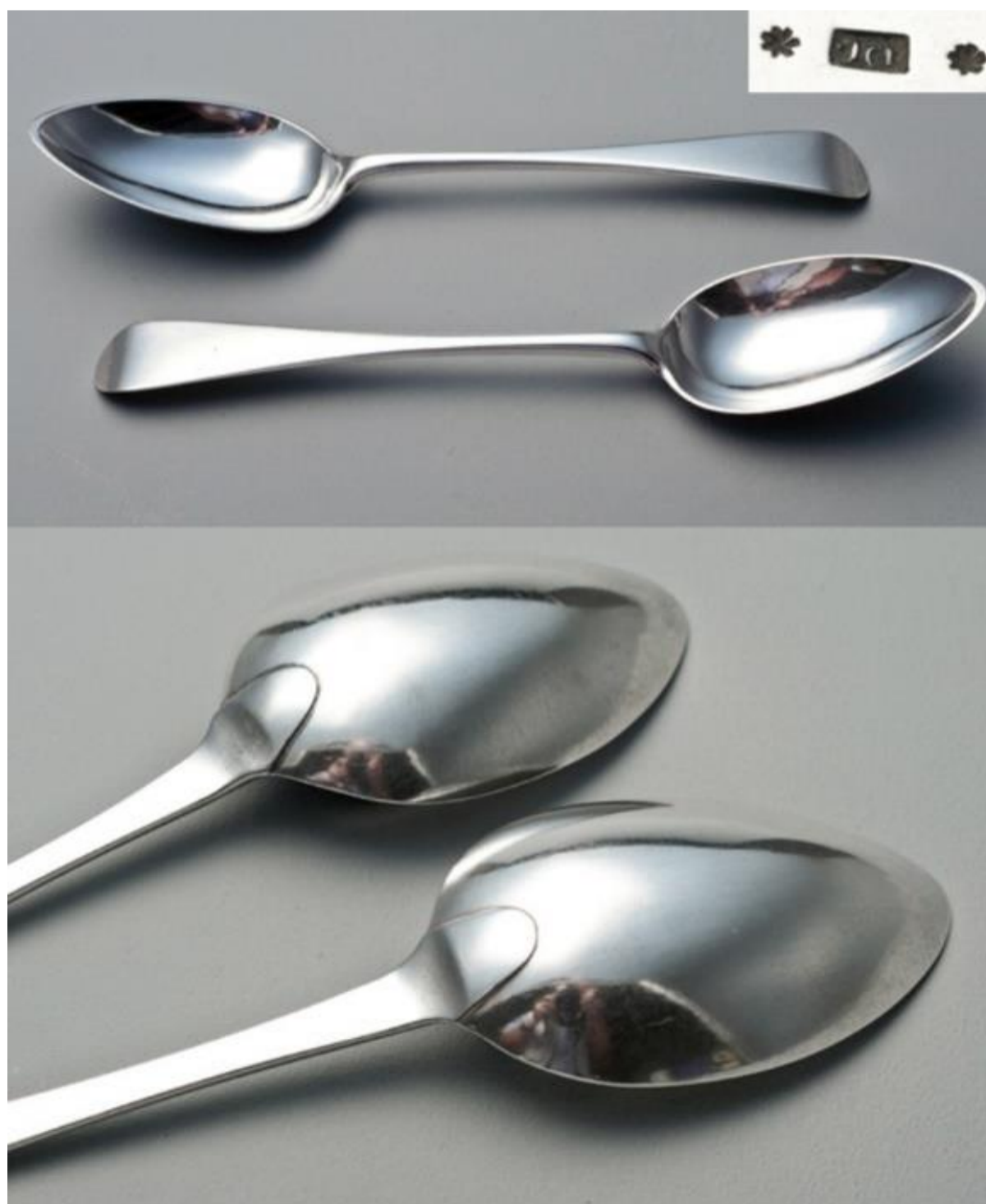
Old English pattern