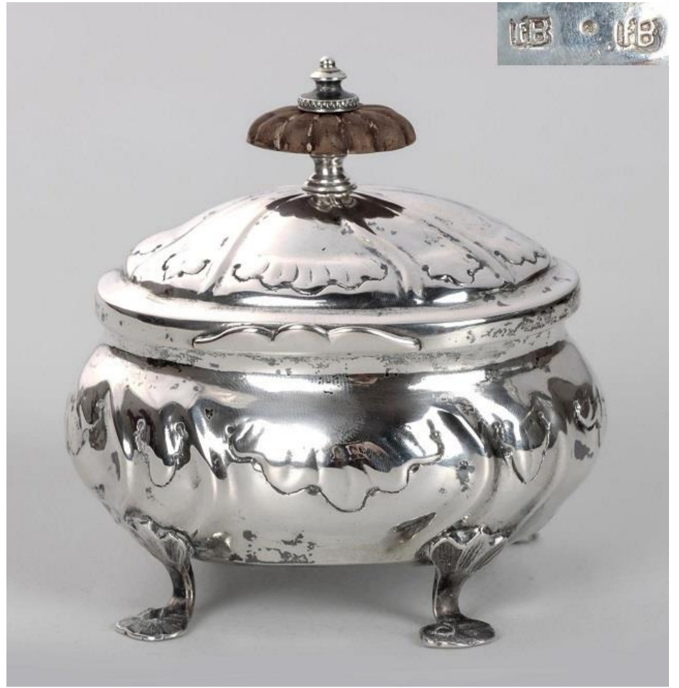
(The finial on the above box probably not original)