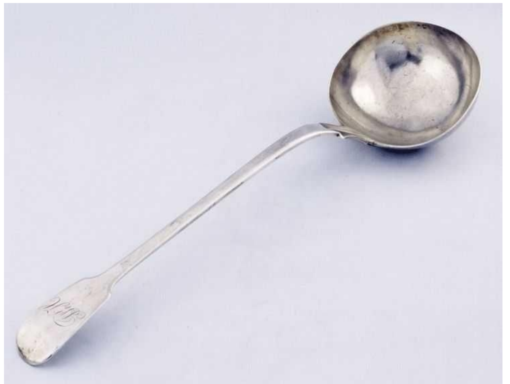
(the ladle on the left by JHV the younger)