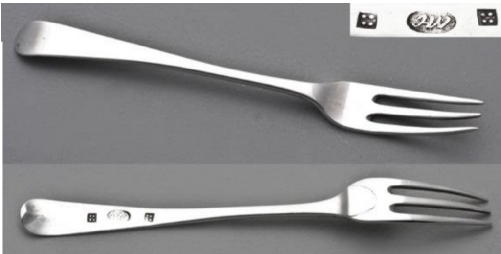
(the fork on the left by JHV the elder)