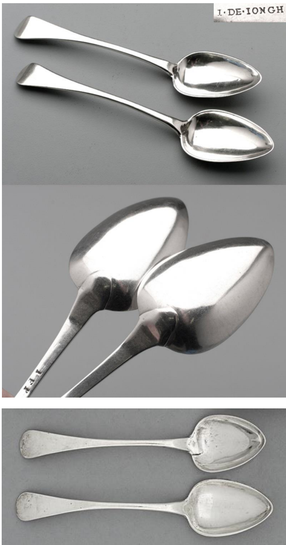
Old English pattern