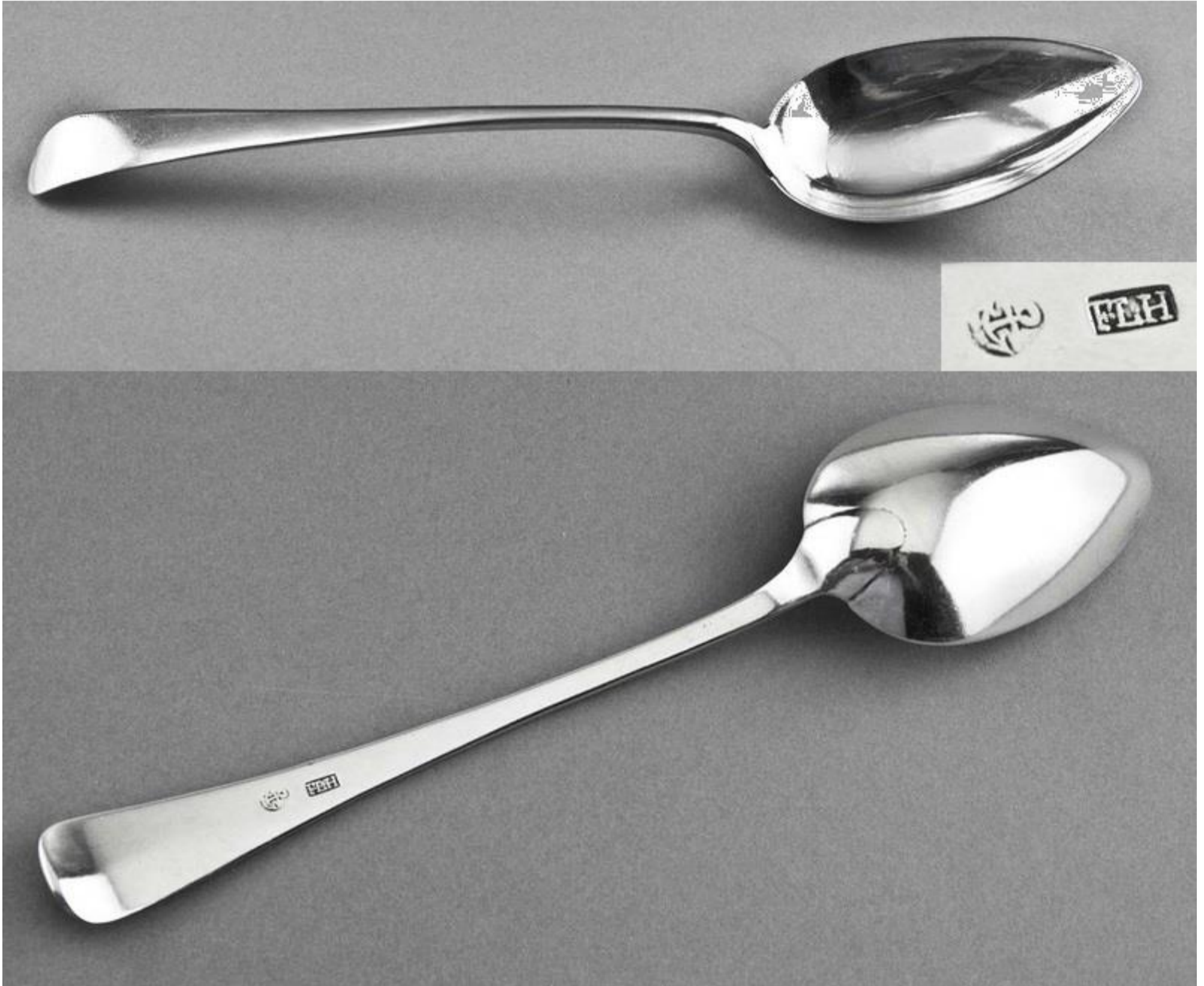
Old English pattern