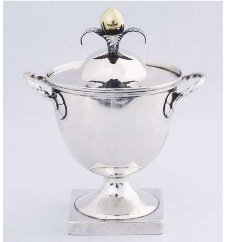
(The finial on this bowl is not original)