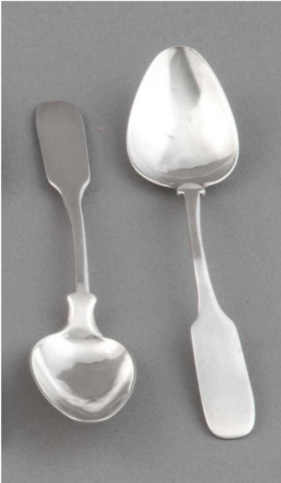
Old English pattern